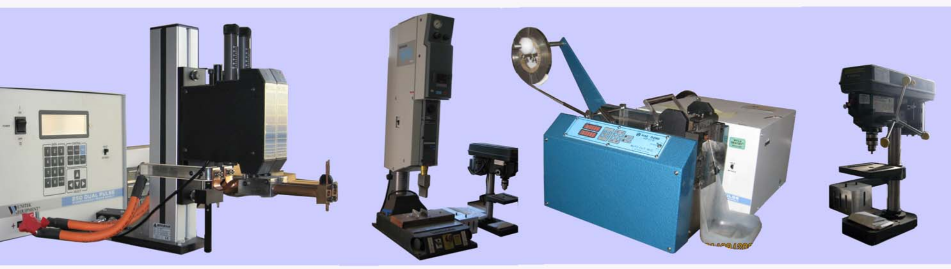
UNITEK spot Welding Machine